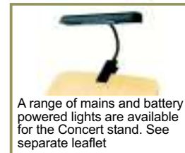
A range of mains and battery powered lights are available for the Concert stand. See separate leaflet