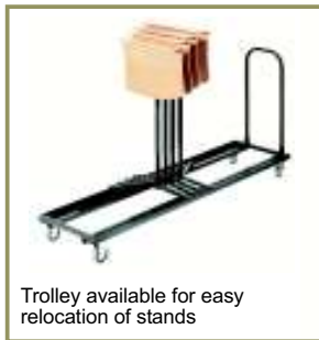
Trolley available for easy relocation of stands

Base is nylon coated for ultimate toughness