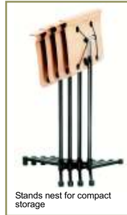
Stands nest for compact storage