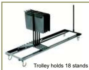
Trolley holds 18 stands