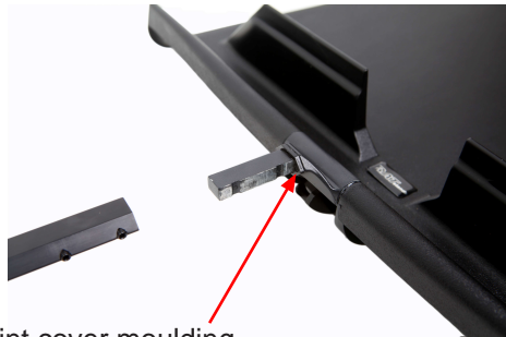
joint cover moulding

1 Insert a 2.5mm Allen key into each of the grub screws in the top of the stem and loosen the screw by about 2 turns.