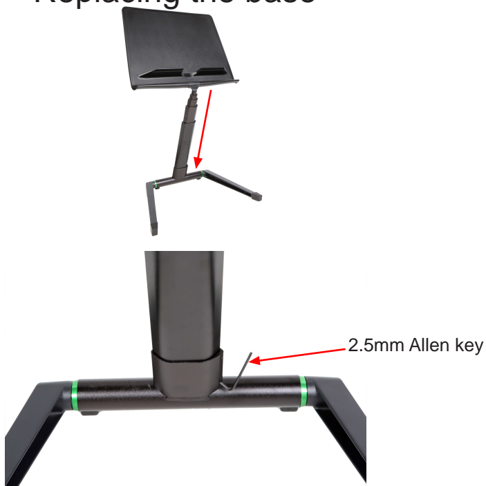
2.5mm Allen key

1 Push the Jazz stand to its lowest position. IT IS IMPORTANT TO DO THIS BEFORE PROCEEDING TO THE NEXT STEP.